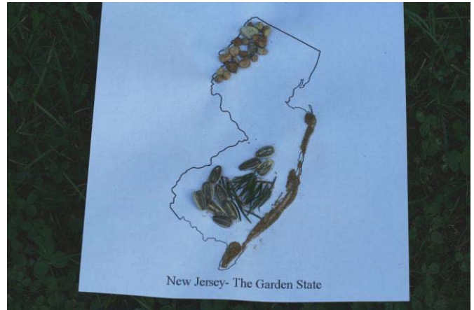
Geography of New Jersey Craft Idea.

A great way to introduce geography to your child is simply by using a map. Find a map of New Jersey and point out where these areas are and where your house is in relationship to these areas. If you'd like to take it one step further, ask your child to study the shape of New Jersey and draw an outline of our state. Use pine needles, sand, small pebbles, and sunflower seeds to glue on different areas showing where each of these landscapes are in New Jersey. You might want to do this on cardboard or thicker paper since the items you'll be gluing can get heavy. Place a star where your house is and your child will have a fun map showing the geography of New Jersey! See the map as an example.