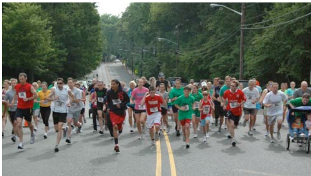
Tree Trot Runners, May 22, 2010.